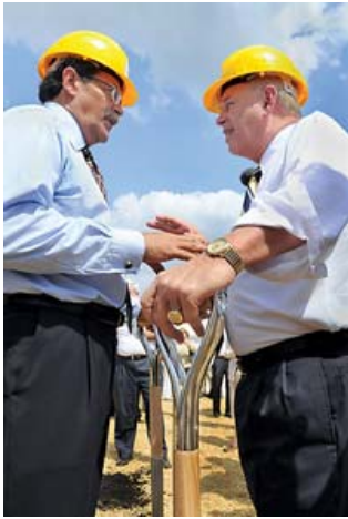
Governor Strickland and CSX CEO Michael Ward talk after participating in a ceremonial ground breaking for the Northwest Intermodal Facility near North Baltimore, Ohio, Aug. 14, 2009.

Among the projects mentioned by the governor as significant wins for Ohio are DuPont 's photovoltaic film line expansion in Circleville