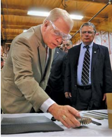
Governor Strickland looks at a small cooling component during a tour of the Catacel Corporation in Garrettsville, Ohio. The Governor was visiting the small company to discuss his education reform for a stronger economy.

In other areas, says Strickland, "We have worked to cut red tape where we could appropriately do that. We had a robust effort to look at all of the state regulations that