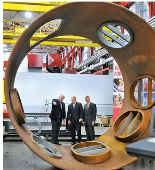
Governor Strickland is seen through a steel tower section that will be used to support a wind turbine, as he tours the automated welding area of The Lincoln Electric Company in Cleveland, Ohio. The Governor was at the company that manufactures welders and welding equipment to announce