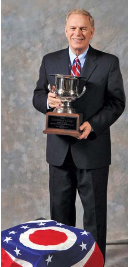
Gov. Ted Strickland with Ohio's fourth consecutive

One is a continued focus on corporate taxation. A Tax Foundation summary of significant state tax changes identifies these Ohio developments in 2009: “Ohio reduced its income tax across the board slightly as part of a package to phase out the corporate income tax, phase in a gross receipts tax, cut the sales tax slightly, phase out the inventory tax, and reduce the income tax by 21 percent over five years. The income tax reduction scheduled for 2010 has been postponed.” “Because of the condition of the economy, we postponed the final phase-out of the income tax by 4.2 percent, but we have followed through